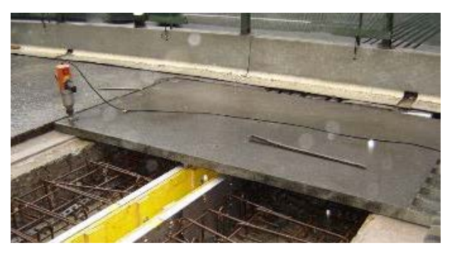
Figure 10. Mini-Fly-Over elements positioned and anchored in place at both sides of movement gap