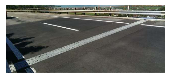
Figure 37. Fully installed cantilever finger joint following concreting in place, and removal of tapered ramps and re-asphalting at each side