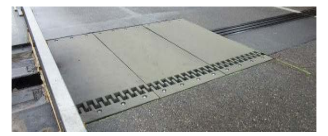
Figure 24. Mini-Fly-Over in place in centre lane while outside lane closed for replacement works