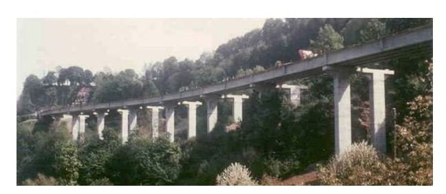
Figure 30. The Linden Bridge in central Switzerland

The Linden Bridge (Figure 30) on the A4 highway in the Swiss canton of Schwyz opened to traffic in 1975. It has a total length of 536 m, with separate three-lane superstructures for each direction of travel. During renovation works in 2015, the existing modular expansion joints at both ends of both superstructures required to be replaced by Tensa®Finger (Type RSFD) cantilever finger joints with a movement capacity of 240 mm each. Disruption to traffic during the joint replacement works had to be kept to an absolute minimum, with work limited to off-peak traffic periods.