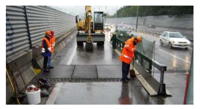
Figure 11. Early on Monday morning, site cleared to allow lane to be re-opened to traffic