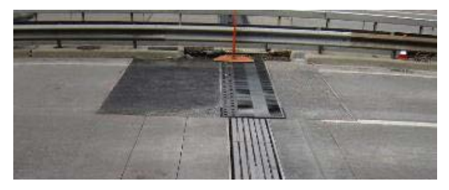
Figure 18. After one week, with road newly asphalted, first phase finished and joint in service

With all work carried out at night and weekends, the replacement of the expansion joints had very little impact on traffic on this busy highway.