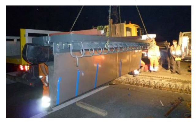
Figure 26. Lifting in of the new finger joint in the first lane during the third weekend