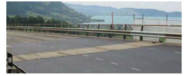
Figure 33. Following anchoring of Mini-Fly-Over in place, road surface temporarily tapered at each side with new asphalt to suit level of plates