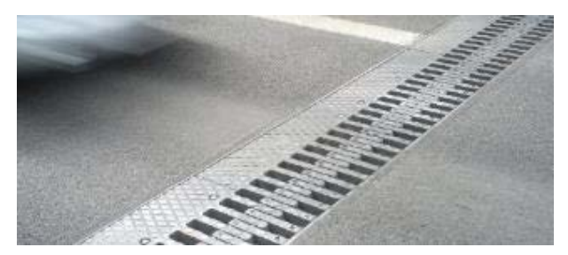
Figure 19. A Tensa®Finger (Type GF) sliding finger joint in service

Tensa-Finger (Type GF) sliding finger joints (Figures 19 and 20) provide a safe driving surface for traffic by means of steel fingers which span the structure's movement gap, interlocking with steel fingers at the opposite side. Like Tensa®Flex finger joints, the fingers that span the gap receive sliding support at the opposite side, minimising moment loading and increasing movement capacity. In common with all finger-type expansion joints, this joint is characterised by the high driving comfort and low noise emissions it offers.