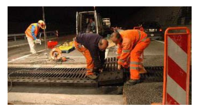
Figure 16. Tensa®Flex finger plates precisely positioned (by hand), element by element