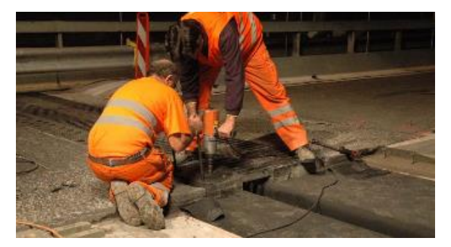
Figure 17. Finger plates anchored to dowels