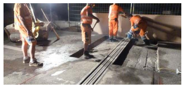
Figure 21. Removal of existing joint in first lane during first weekend

could be coordinated, with the same Mini-Fly-Over plates used on both structures, one after the other. Images from the installation work on one structure are presented in Figures 21 to 27.