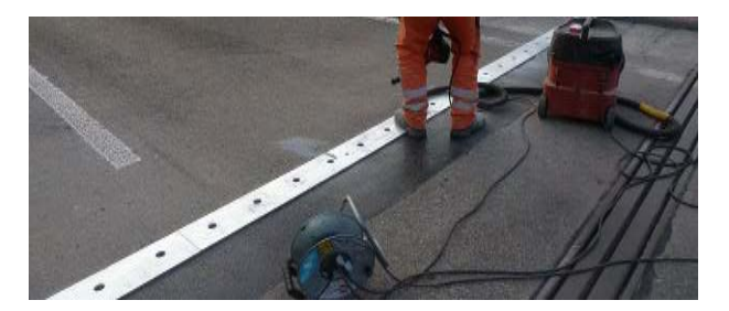
Figure 32. Drilling of holes (using template) in polymer concrete strips for Mini-Fly-Over anchors