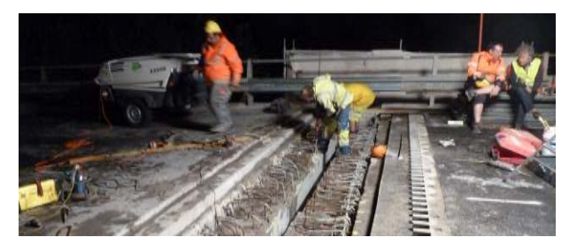
Figure 35. Final preparation of recess prior to lifting in of a new cantilever finger joint