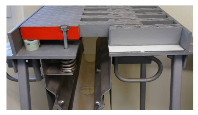
Figure 20. Full-scale model of Tensa®Finger (Type GF) sliding finger joint, showing its construction

A typical design for this type of joint is shown by the following image of a full-scale model. The type shown has stainless steel spiral springs to pretension the sliding finger plates downwards, but alternative spring types may be used.