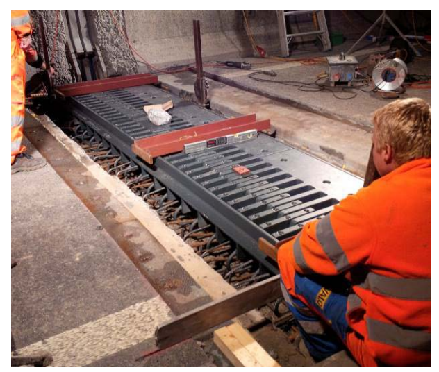
Figure 27. Levelling of new finger joint prior to concreting and completion of connecting road surfacing