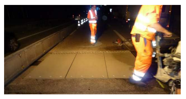
Figure 22. Mini-Fly-Over as placed in first lane at end of first weekend