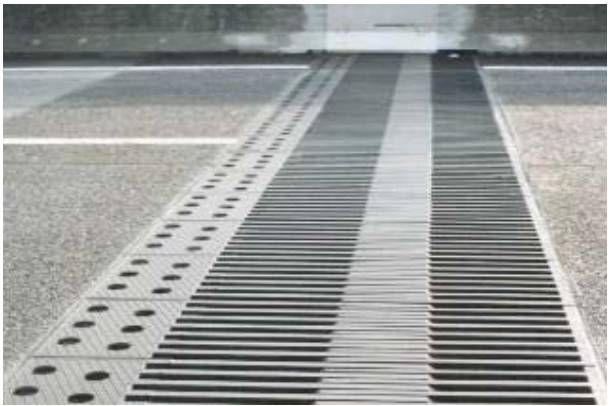
Figure 3. A Tensa®Flex expansion joint, as installed at the end of a road bridge