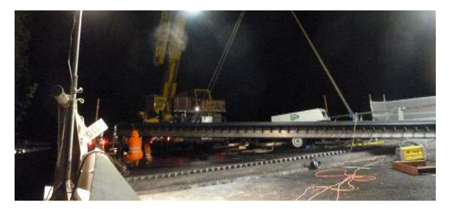
Figure 36. Lifting in of a new cantilever finger joint