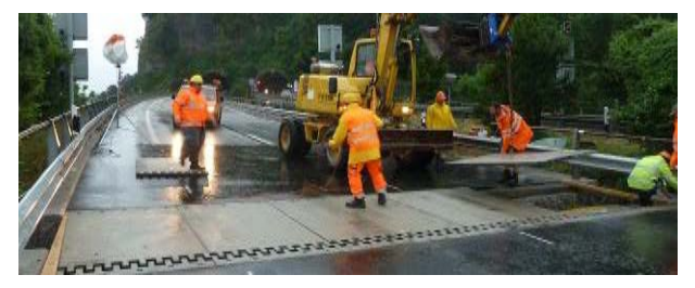
Figure 34. Removal of Mini-Fly-Over at start of a work shift to allow recess preparation to proceed