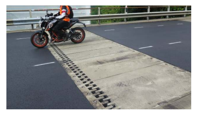
Figure 2. Traffic can flow freely during peak hours, with Mini-Fly-Over (in this case raised above normal surface) spanning the construction area

When the preparatory works have been completed, the Mini-Fly-Over is removed for the last time during a suitable road or lane closure and the new expansion joint is lifted in and fully installed.