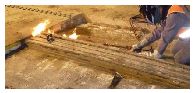
Figure 23. Removal of joint in second lane for placing of Mini-Fly-Over during second weekend