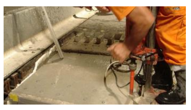
Figure 13. By Wednesday evening, concrete cured sufficiently to drill anchor holes and place dowels