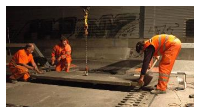
Figure 15. On Thursday night, Mini-Fly-Over removed for the last time