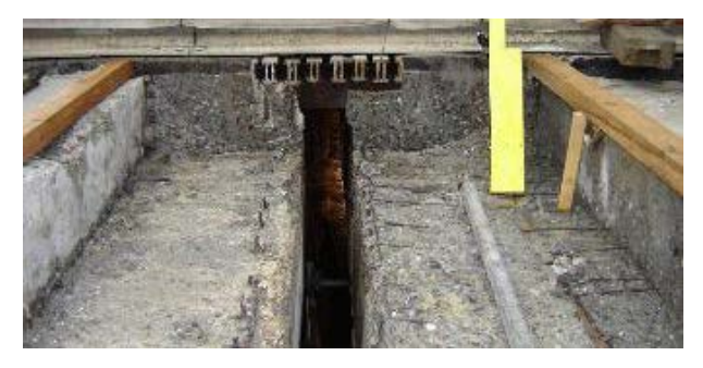
Figure 7. Recess cleanly excavated and subsoil compacted