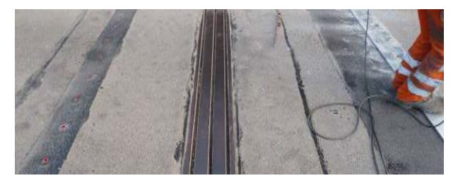
Figure 31. The existing expansion joint prior to removal, with polymer concrete strips (darker colour) cast at each side to support Mini-Fly-Over

Images from the replacement of one of the four expansion joints are presented in Figures 31 to 37.