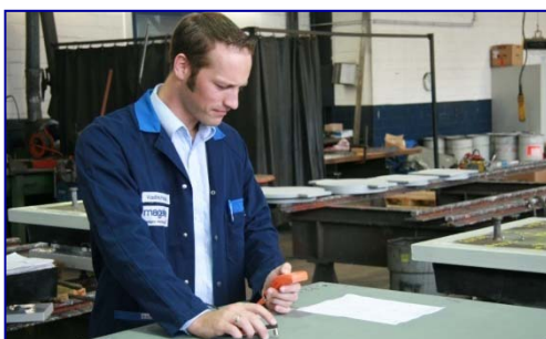
Reducing ecological impact by continually striving to deliver long-life quality products

mageba's home town of Bulach (Switzerland) has this year embarked on a new initiative to promote Sustainability among the approximately 700 businesses located in the town, by presenting an annual award. By choosing a musical triangle for the form of the award, the town shines a spotlight on the winning company for its exemplary practices, in the way a triangle marks a special highlight in an orchestral work. The competing companies were assessed by a nine-member jury of experts under the categories Economy, Ecology and Social . mageba is proud to receive this inaugural award in recognition of its efforts over many years to contribute to the economy and community in a sustainable way.