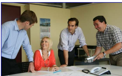
Part of the social contribution of mageba – meaningful employment for many people

The issues for which mageba has been rewarded are core principles of the company. As a socially conscious employer, mageba recognises that the most significant impact it can have on its community, be it in Bulach or at any of its subsidiary locations, is to provide meaningful employment and thus support the economy. mageba further recognises that a contented employee, given the opportunity to make an important contribution, will be motivated to strive for the success of the venture, thereby contributing to its economical and social sustainability. Of course, the third side of the triangle, ecology, is never far from the minds of the mageba team, with widespread activities in recycling, energy saving and pollution reduction, and perhaps most significantly, in the primary goal of the company, to always deliver long-life high quality products requiring minimal maintenance. mageba intends to invest the CHF 5,000 prize money in a sustainable project by purchasing an eco-friendly automobile, which will further help to protect the environment. The vehicle will be available to all employees and the rental income is designated for social purposes.